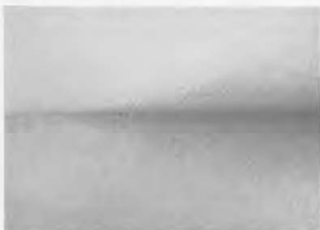
Figure 2. Same ink at 900 feet per minute. The filaments break closer to the "nip" because elastic forces are built up more rapidly at higher speeds.