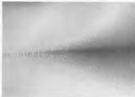
Figure 1. Filamentation of white offset ink with the Inkometer rollers turning at 300 feet per minute. The filaments reach a length of four-hundredths of an inch, forty times the thickness of the ink film. There is very little ink "mist."

the International Printing Ink Division of Interchemical Corporation has studied this problem using an inkometer and the Microflash. The inkometer allows measurement of the torque required to split an ink film of predetermined thickness. It consists essentially of two inked roll-