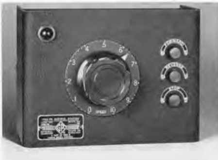
Figure 2. Compact Control Station for Type 1702-M Three-Quarter Horsepower Control.

An application where the excellent starting characteristics of the control have proved of great value has been for the spindle drives of a battery of ten winding lathes for transformer coils in our own plant. Here, in order to obtain maximum production, over-voltage starting is employed with a special low-