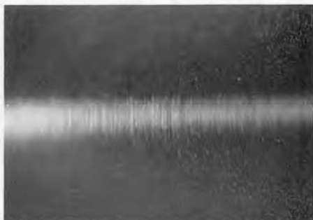
Figure 4. An ink which "flies" badly at a speed of 300 feet per minute. The filaments stretch out to one-eighth inch before breaking. Many free-floating ink particles are thrown off.

ers, the speed of which can be varied to simulate actual press condition. The Microflash allows high-speed photographs to be taken of the ink filaments that form as the ink film on the rollers separates.