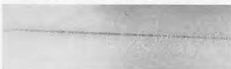
Figure 3. A head-on view of the same conditions shown in Figure 2. There are about 130 filaments per inch.