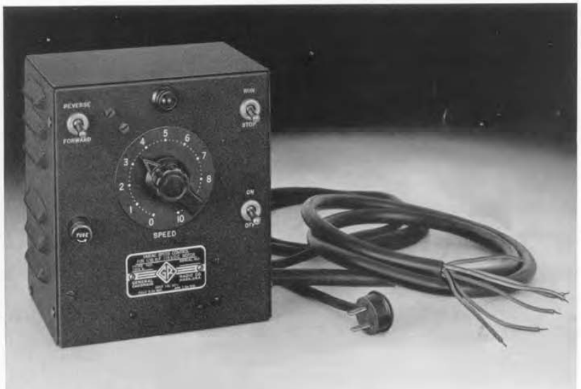
Figure 1. The Type 1703-A One-Sixth Horsepower Control.

THE TYPE 1702-M is a new 3/4-hp control for push-button operation, which is an alternative to the TYPE 1702-A.